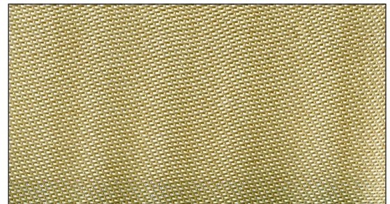
36 oz. shown